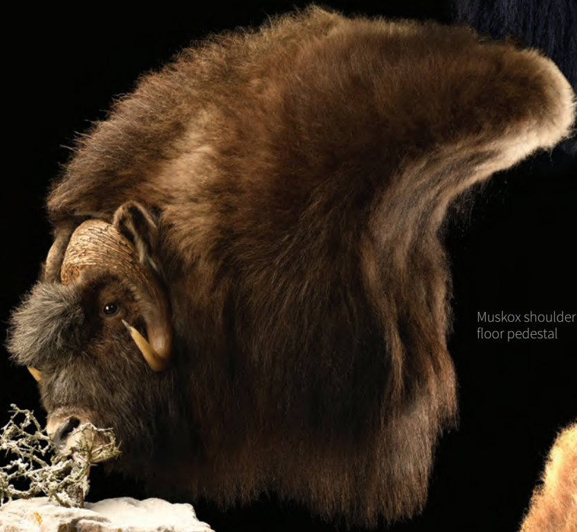
Muskox shoulder mount, floor pedestal