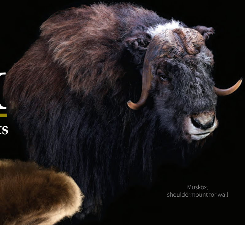
Muskox, shouldermount for wall