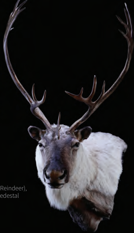
Caribou (Reindeer), Wall pedestal