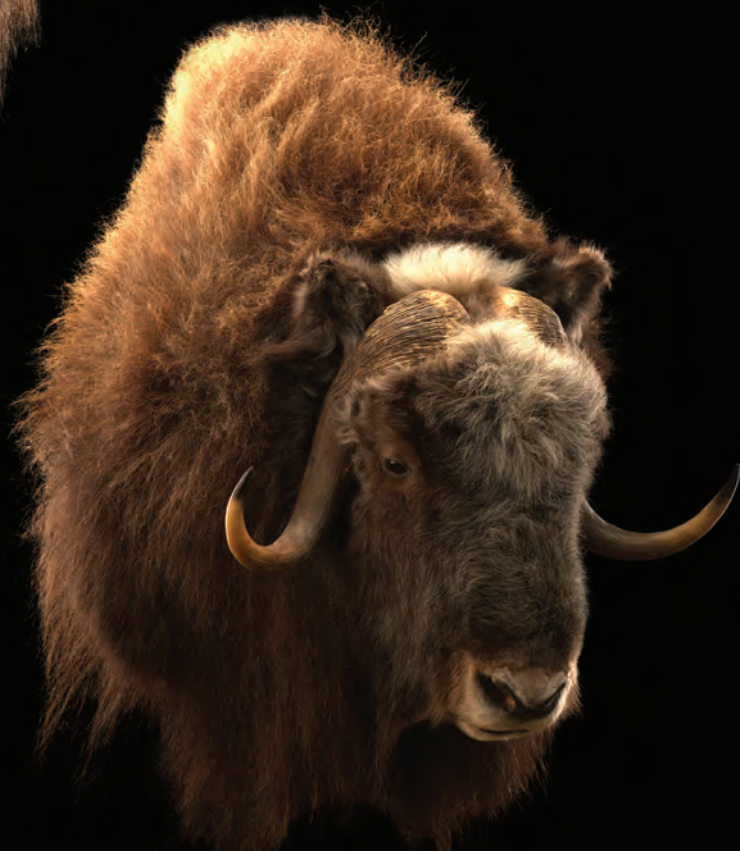
Muskox, shouldermount for wall